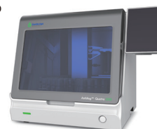
ProAb - 1300