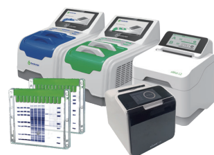
Full Western Workflow