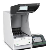
Maxi - 1400