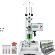
CytoSinct cell isolation platform